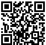
Photo Shoot Special

If interested in this amazing deal, please feel free to contact.