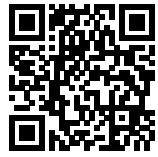
Photo Shoot Special

https://www.genclassifieds.com/x-504363-z