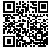
Photo Shoot Special

https://www.genclassifieds.com/x-504363-z