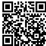
Photo Shoot Special

https://www.genclassifieds.com/x-504363-z