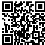
Photo Shoot Special