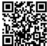
Photo Shoot Special

https://www.genclassifieds.com/x-504363-z