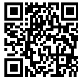
Photo Shoot Special