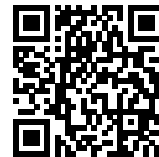
Photo Shoot Special