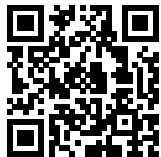
Photo Shoot Special