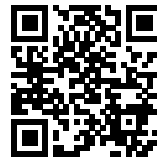
Photo Shoot Special