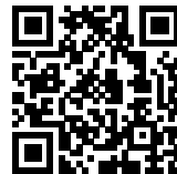
Photo shoot special

https://www.genclassifieds.com/x-569133-z