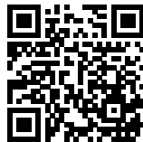
Photo shoot special

https://www.genclassifieds.com/x-569133-z