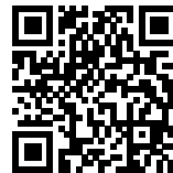
Photo shoot special

https://www.genclassifieds.com/x-569133-z