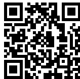
Photo shoot special

https://www.genclassifieds.com/x-569133-z