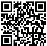
Photo shoot special

If interested in this amazing deal, please feel free to contact.