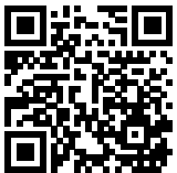
Photo shoot special

If interested in this amazing deal, please feel free to contact.