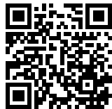
Photo shoot special

https://www.genclassifieds.com/x-569133-z