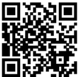
Photo shoot special

https://www.genclassifieds.com/x-569133-z