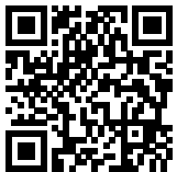
Photo shoot special

https://www.genclassifieds.com/x-569133-z