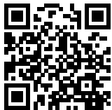
Photo shoot special

https://www.genclassifieds.com/x-569133-z