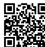
photo assistant needed for a couple of corp location shoots in January (Boston) hide this posting https://www.genclassifieds.com/x-787188-z