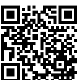
photo assistant needed for a couple of corp location shoots in January (Boston) hide this posting https://www.genclassifieds.com/x-787188-z